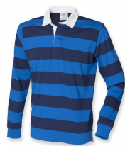
REGATTA BLUE / NAVY