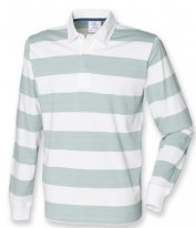
WHITE/DUCK EGG BLUE