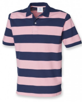
PINK / NAVY