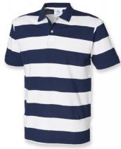
NAVY / WHITE