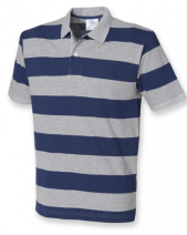
HEATHER GREY / NAVY