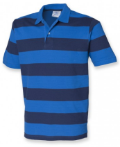
REGATTA BLUE / NAVY