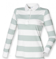
WHITE/DUCK EGG BLUE